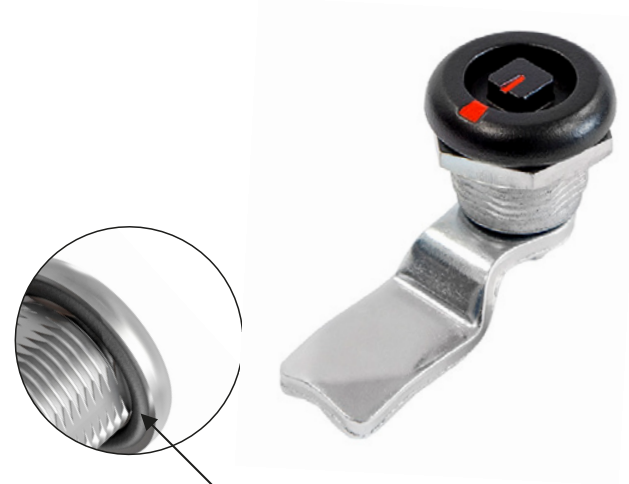
Housing with foamed sealing PUR