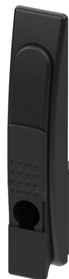
For a cogwheel mechanism [M]